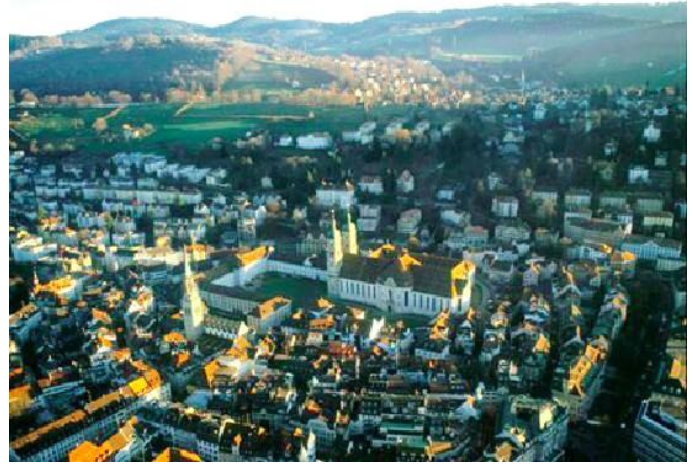
St. Gallen, Switzerland

Several countries are poised to receive teams from the U.S. in 2013, but for 2012, all of our IC projects will probably be Impact Missions , Europeans going to Europeans. Slated for this year are: a team from Ireland going to St. Gallen, Switzerland (on the 1,400 th anniversary of the town's founding by an Irish monk), a team from Italy going to Hungary for a "Roman Festival Week", and possibly a team hosted in Italy for a "Family Week" of evangelism.