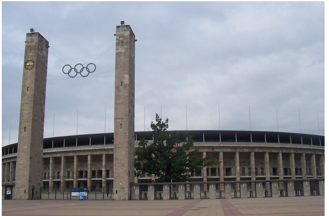
Berlin Olympic Stadium